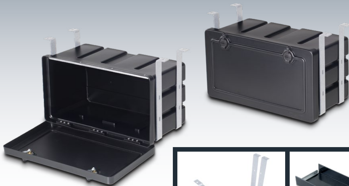
Image: 2-point lock with accessories