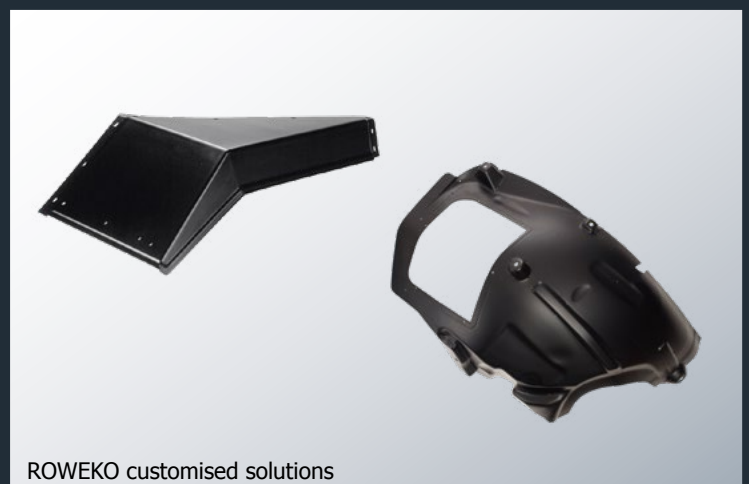
ROWEKO customised solutions