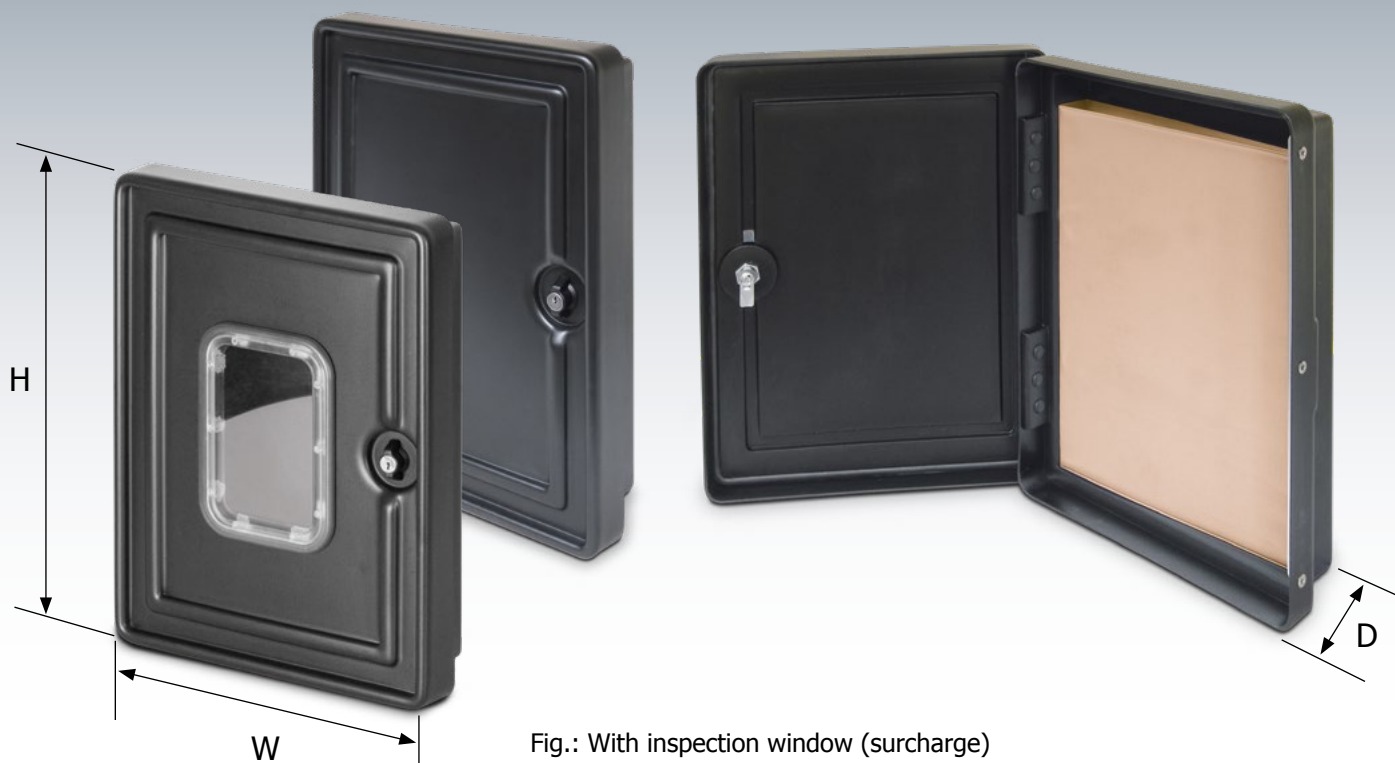
Fig.: With inspection window (surcharge)